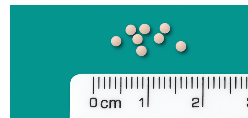
Contents of a 20-mg packet.