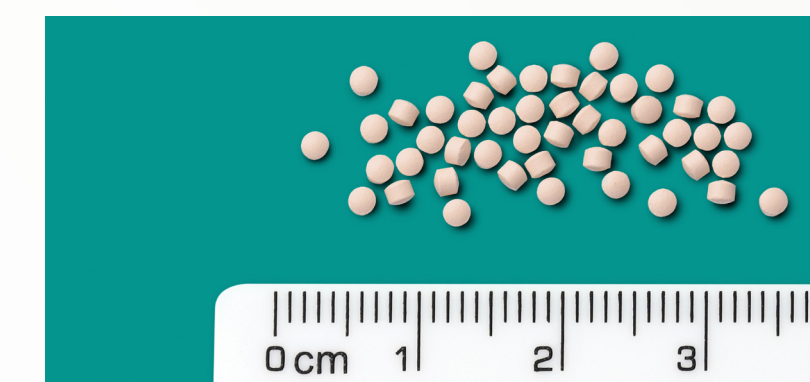
Contents of a 120-mg packet.

Tablets and oral pellets shown as actual size.