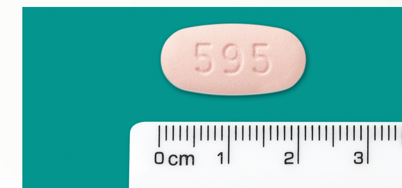
480 mg tablet.